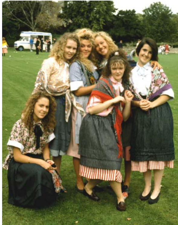
Teenagers at the Fisherman's Walk, Musselburgh (East Lothian) 1987.

some of the teenagers in the town, as can be seen in the first of the images below. The Flambeaux at Comrie are long birch poles with hessian-wrapped ends which are soaked in paraffin for several days. They are taken out on Hogmanay (31 December), and assembled at a particular location in the town where they are lit on the stroke of midnight and then carried through the streets. The Scottish Miners Gala and Free Colliers March are examples of urban festival activities, and take place in Edinburgh and Falkirk respectively. Fieldwork at the Scottish Pipe Band Championships at Dumbarton was instigated by a Postgraduate student who was particularly interested in the subject. Parades with a political motive have also been covered in fieldwork, the images collected