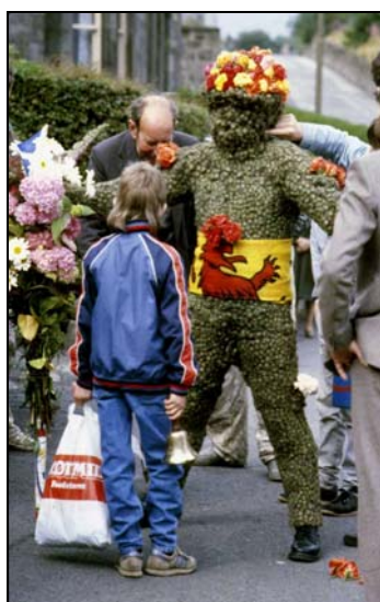
The Burryman, South Queensferry (Edinburgh), 1986.